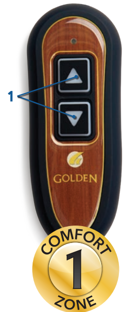
ONE ZONE POSITIONING SYSTEM

Comfort Zones 1 & 2 work together to create individualized wellness positioning and comfort. Each Comfort Zone can be adjusted independently by using the exclusive AutoDrive hand control.