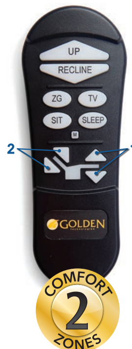
TWO ZONE POSITIONING SYSTEM

Comfort Zones 1 - 4 provide an ergonomic comfort experience with an emphasis on head and back support. Each Comfort Zone can be adjusted independently by using the exclusive AutoDrive hand control.