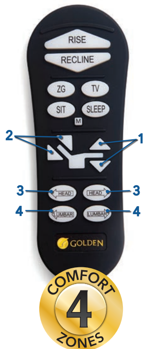
FOUR ZONE POSITIONING SYSTEM

Comfort Zones 1 - 5 This positioning system incorporates all five adjustable comfort zones to create the ultimate wellness comfort experience. Each Comfort Zone can be adjusted independently by using the exclusive AutoDrive hand control.