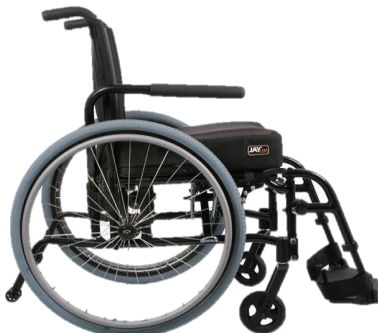
Quickie QXi, Ultra Lightweight Adjustable Folding Wheelchair