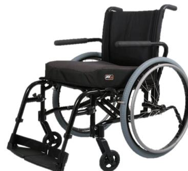
Quickie QXi featuring the Jay ION™ cushion