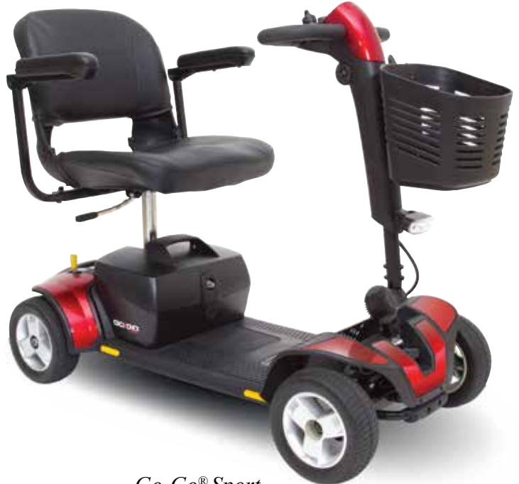
Go-Go® Sport, 4-Wheel