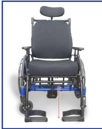
Larger front openings make it easy for wheelchair movement by foot