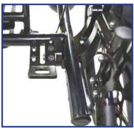
Foot Tilt release option for easy tilt by stepping