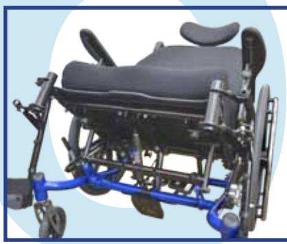
Dual Cross Gas Cylinders located underneath the chair, allows for a gentle, slow tilt for the client, lockable at infinite angles