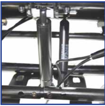
Dual cross gas cylinders to recline wheelchair with ease